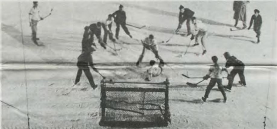
Early morning ice hockey at Baker rink? (Princeton Country Day School 1948)