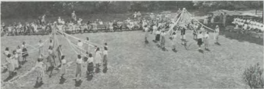
Dancing around the Maypole? (Miss Fine's circa 1948)