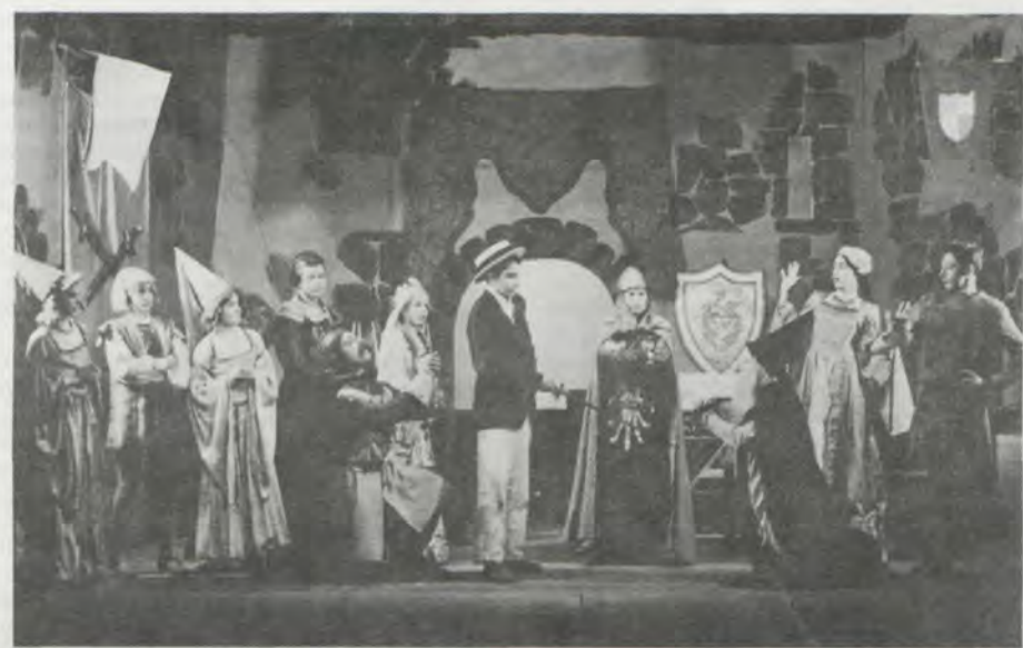
"A Connecticut Yankee in King Arthur's Court," May 1943