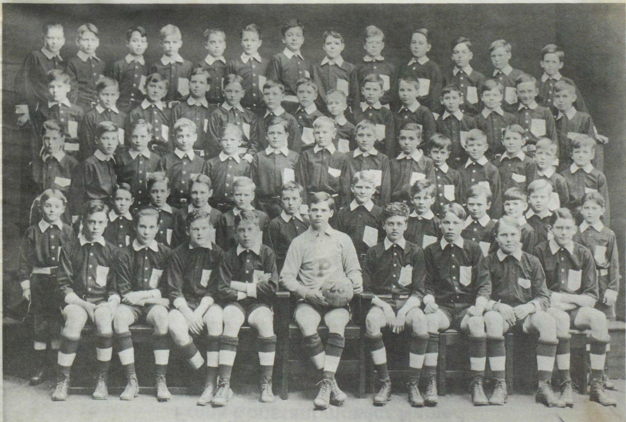
Princeton Country Day School 1928