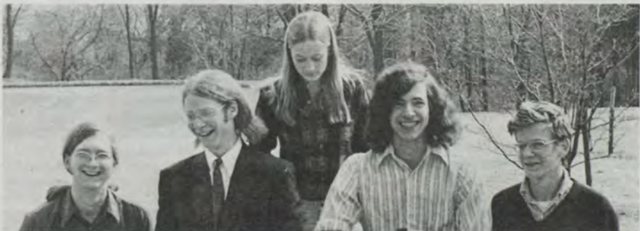
When hair was long and skirts were short? (Princeton Day School 1971)