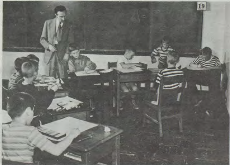
We know it's Thursday, May 19th, but who knows the year and the names of the students and teacher?